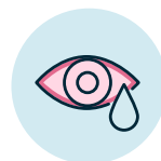
Red and/or watery eyes