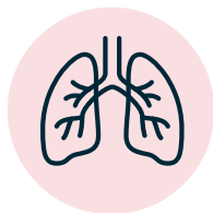
Infection in the lungs (pneumonia)