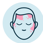
Rash (appears 3 to 5 days after you first become sick)