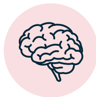
Swelling of the brain (encephalitis)