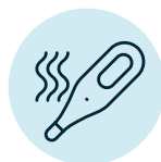
High fever (as high as 104°F)

You can get sick 7 to 14 days after being near someone with measles.