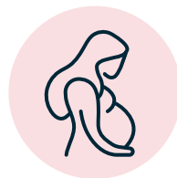
Problems during pregnancy*